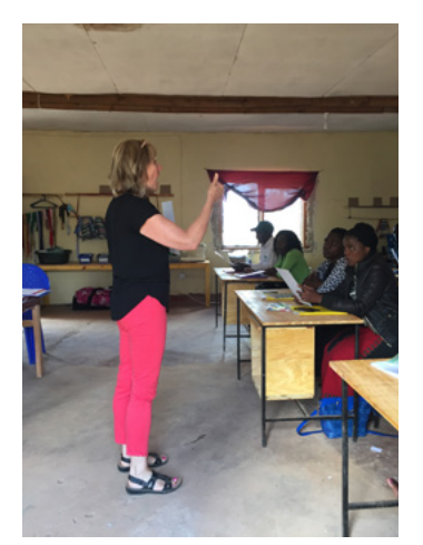
Teachers worked in teams to practice sample lessons for the rest of the group. We were impressed with how much they learned this week!