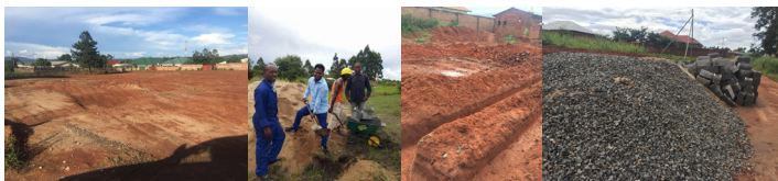
Phase 1 - purchasing land, building drawings approved, clearing the land and laying the foundation.