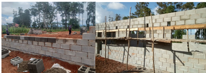
Phase 2 – erecting walls, all window and door openings completed, septic.