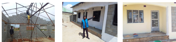
Phase 3 – iron sheet roofing, windows and doors, painting inside & out. Completed August 4, 2020!