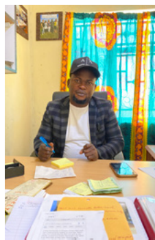
The Director's office