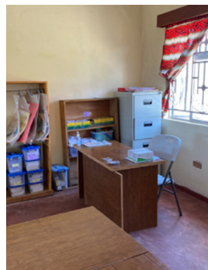
Teacher planning desk area.