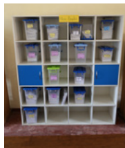
Book shelf to feature new books.