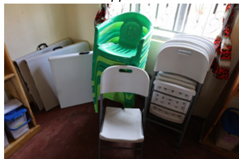
Chairs and Tables