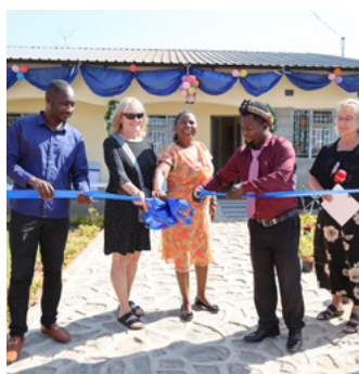
MELT Ribbon cutting