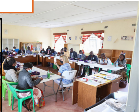
Teachers are busy learning new curriculum.