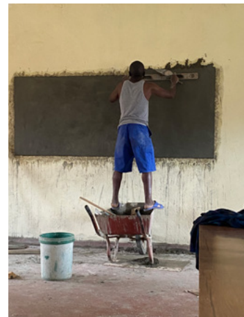
Building the blackboard