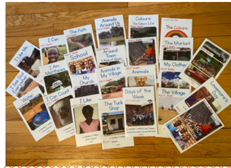
MELT books published to date.