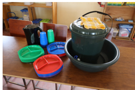
For the kitchen - teacher meeting supplies