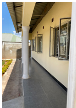
Porch greeting area

These photos of the MELT Central Library taken in August 2022 depict the various uses of this magnificent building!