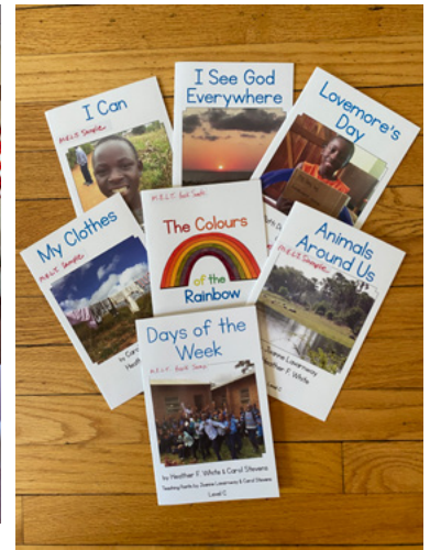
Books published 2020-2 were reviewed with teachers.