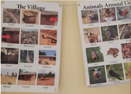
MELT vocabulary poster lessons were reviewed - each teacher received a set of 9.