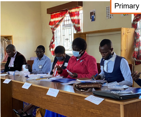
Teachers use the Simple Words Kit Curriculum they requested in 2019!