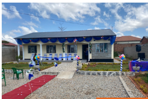
Library adorned for the Grand Opening

“Education is a human right with immense power to transform. On its foundation rest the cornerstones of freedom, democracy and sustainable human development.” ~Kofi Annan