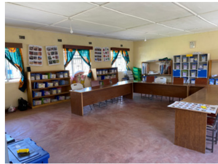
Book storage & meeting space