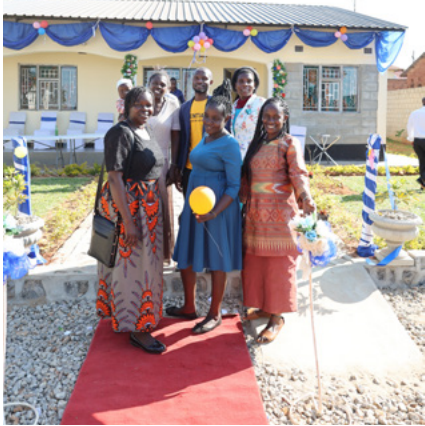
A group of teachers attending the grand opening of the library.