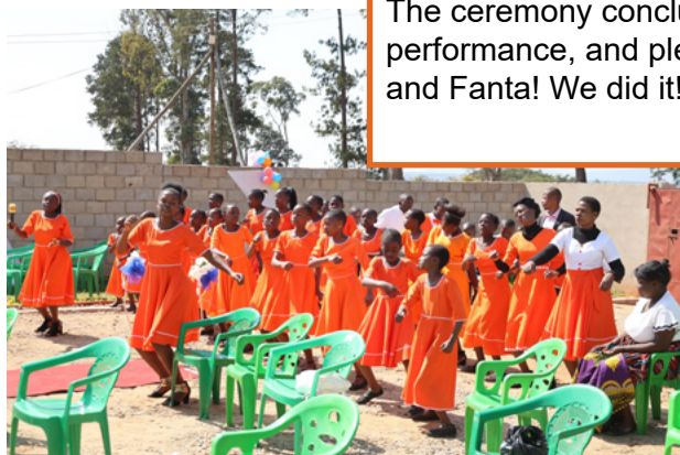
A happy children's choir receives books after their performance.