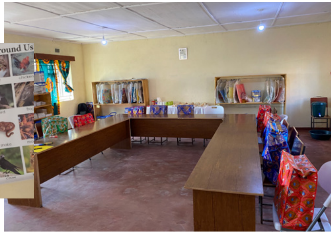
MELT Library ready for the workshop complete with tote bags of teacher materials.