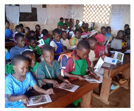
Typical Malawi classroom size of those who receive the books created by M.E.L.T.

First on the long "to do" list is to design, have built, and fill new bookshelves for the MELT Central Library. The Crane Cargo shipment has arrived and is going through the customs process after which the MELT Malawi team will get the 5 crates North from Lilongwe to Mzuzu to unpack at the library. It's exciting to note title 30 has been published! That is 15,000 books in the hands of kids!! Malawiearlyliteracy.org